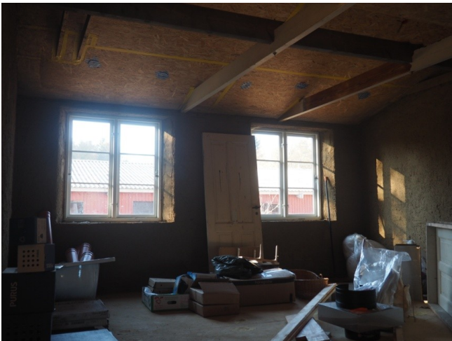
Multi-room that can be divided into two.