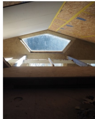
Look to the south / forest side from the loft.