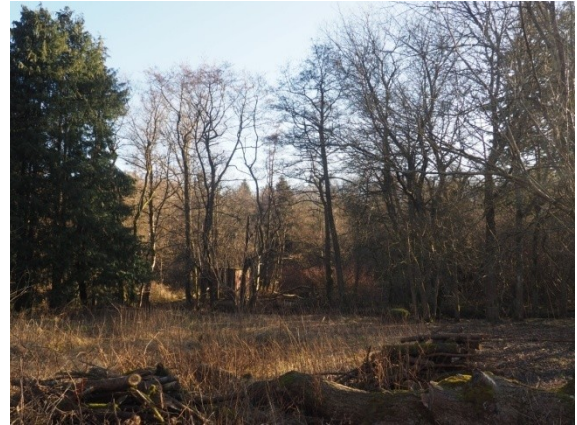
Nature south of the residence / terrace door.