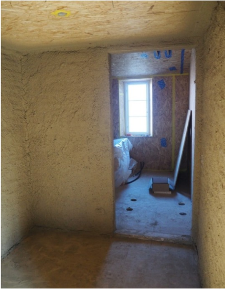
Walk-through / cloakroom and bathroom