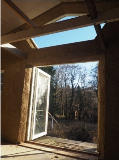
View from living room.