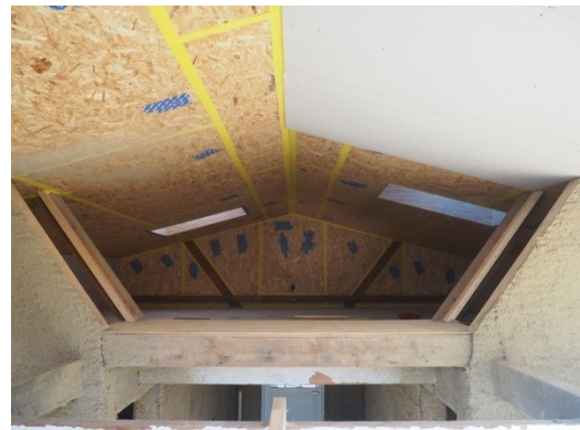
Look into the loft from kitchen