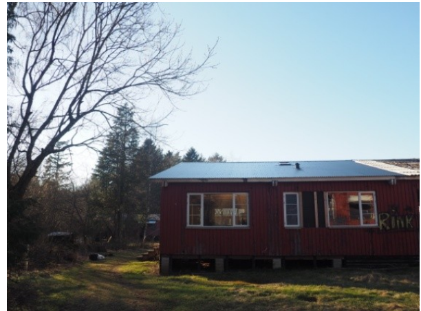
The home seen from the east (windows in the kitchen-living room and bathroom and bedroom).