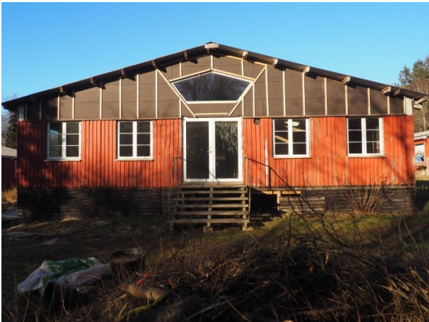
The home seen from the south (windows and terrace door in kitchen-dining room)

Common expenses are determined and regulated by the general assembly and currently DKK 800 is paid per adult monthly, which covers renovation, property tax, property value tax, water / heating / electricity and maintenance costs. When the home is completed, water / heat / electricity consumption will be paid individually for the home.