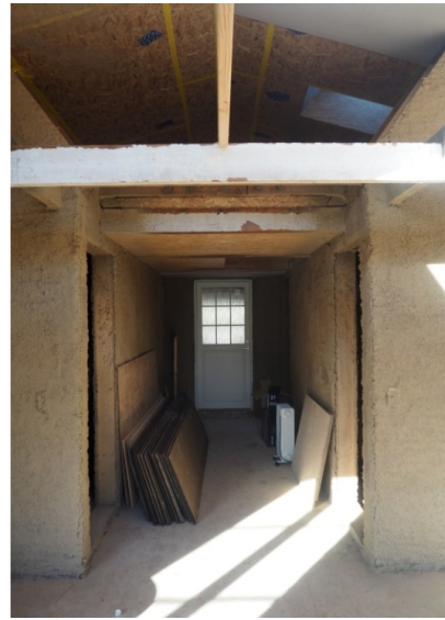
The end of the house and the front door to the barracks, where the neighbor family is building their home. Here an distribution corridor will be built and possibly technical room.