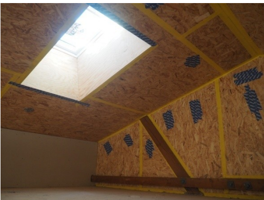
Skylight velux windows on loft.